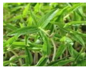
TRANSFORMING AGRICULTURE AND FOOD SECURITY

Harnessing Nanotechnology for Sustainable Development in Energy, Water, Health and Agriculture